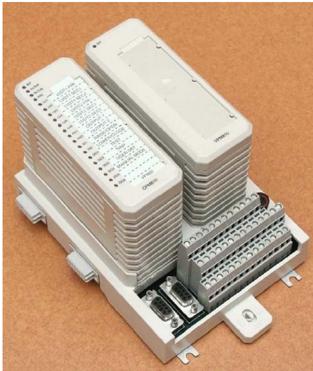
VP800 (CPM810 + VPM810 + TBU810)