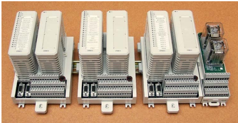
ABB Inc. Business Unit Power Generation